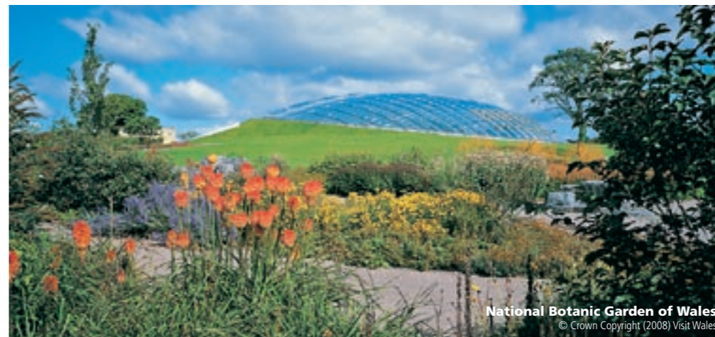
National Botanic Garden of Wales

Savour the stunning scenery of South and West Wales with a day spent in the Pembrokeshire National Park and visits to two of the region's renowned gardens.