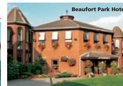
Beaufort Park Hotel