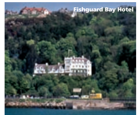
Fishguard Bay Hotel