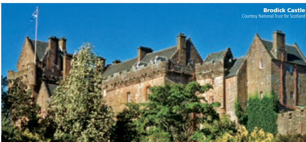
Brodick Castle

In true island-hopping tradition we present the ultimate in west coast scenery, travelling from south to north and taking in the islands of Arran and Mull. The ferry crossings are an appealing part of this tour as they give an opportunity for panoramic views of the wonderful coastline and off lying islands.