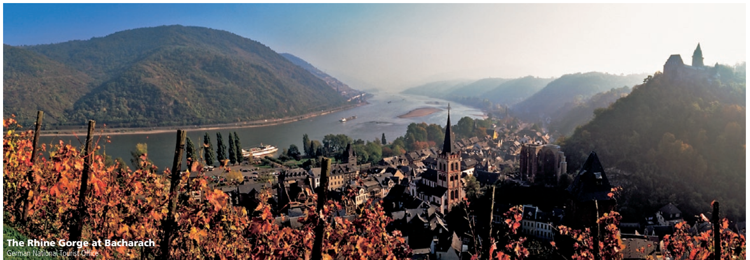
The Rhine Gorge at Bacharach

Prices are based on a Sunday arrival in Boppard.