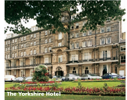
The Yorkshire Hotel

Day 4 Homeward journey, travelling first to Holmfirth where much of "Last of The Summer Wine" is filmed. A walking tour of the town is included to reveal many sites familiar to regular viewers.