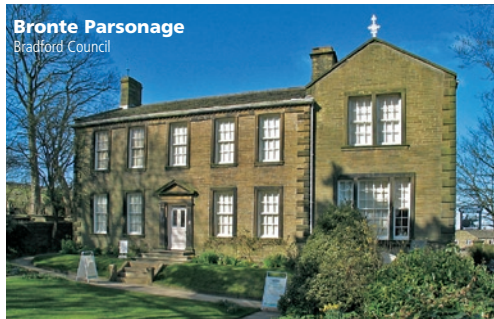
Bronte Parsonage Bradford Council